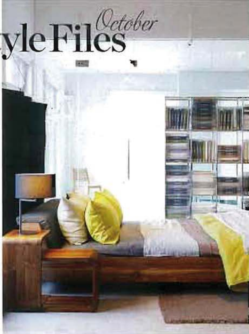
ABOVE: Bed , $8,186; linens , from $156 to $625; side tables , $880 to $910 each; lamp , $715.

TOP CENTRE: Art by Mary Judge is in keeping with the store's nature-inspired inventory. $625 each. RIGHT: Etel's mod tea trolley has all the charm of an antique. Zalsupin tea trolley , $7,705.