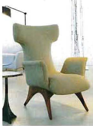
LEFT: Ondine chair , from $7,458. BELOW: The Dul stool is kept in stock. $1,695.