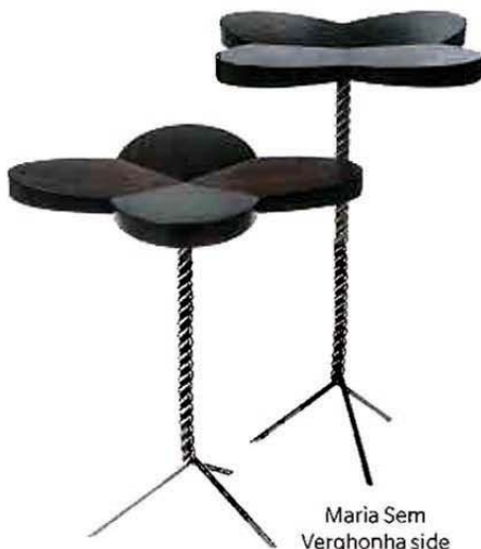
Maria Sem Verghonha side tables, $1,140 to $1,440.