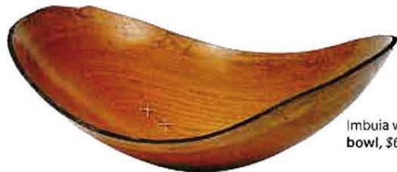
Imbuia wood bowl, $685.