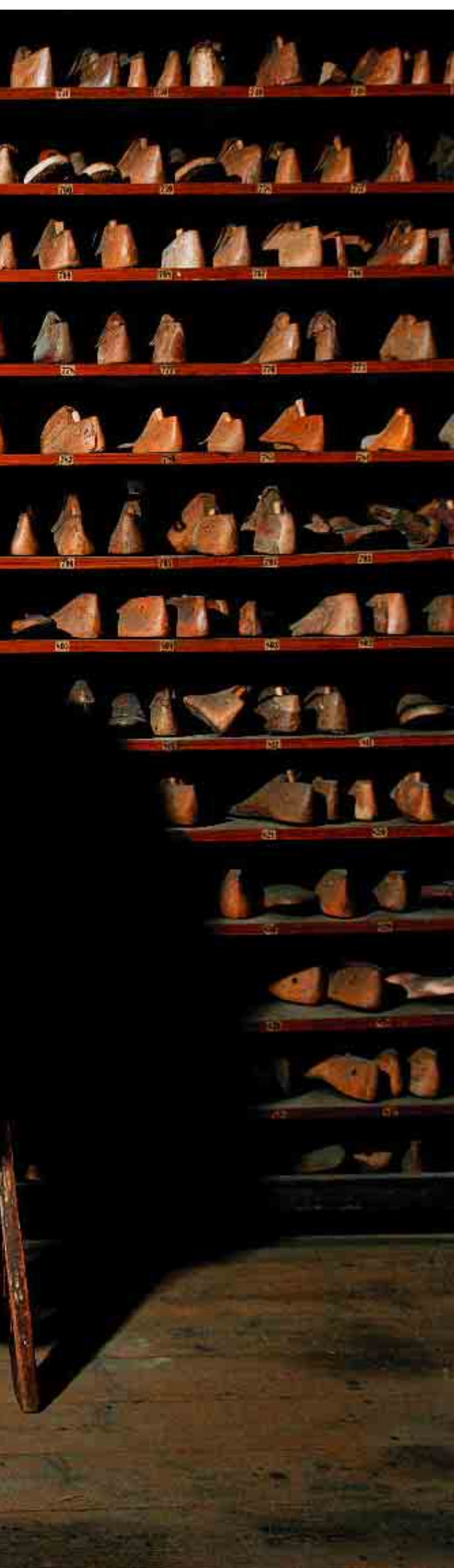
LEFT Markus Scheer, the seventh generation of Rudolf Scheer & Söhne, hand-carves all the wooden lasts.