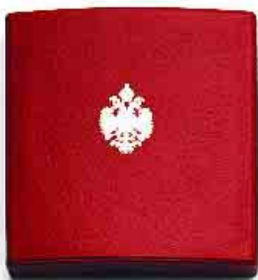
Köchert made a number of diamond stars for Austrian royalty, including 10 pointed stars with pearls at the centre.