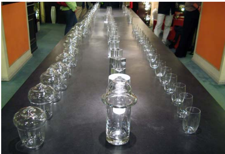
max lamb for j. & I. lobmeyr the project involved glass blowing, cutting and engraving

for his joint work with j. & I. lobmeyr , british designer max lamb applied a holistic approach to both the company and the subject of enhancing glass, realizing a project in each of the most important areas for lobmeyr: glass blowing, cutting and engraving.