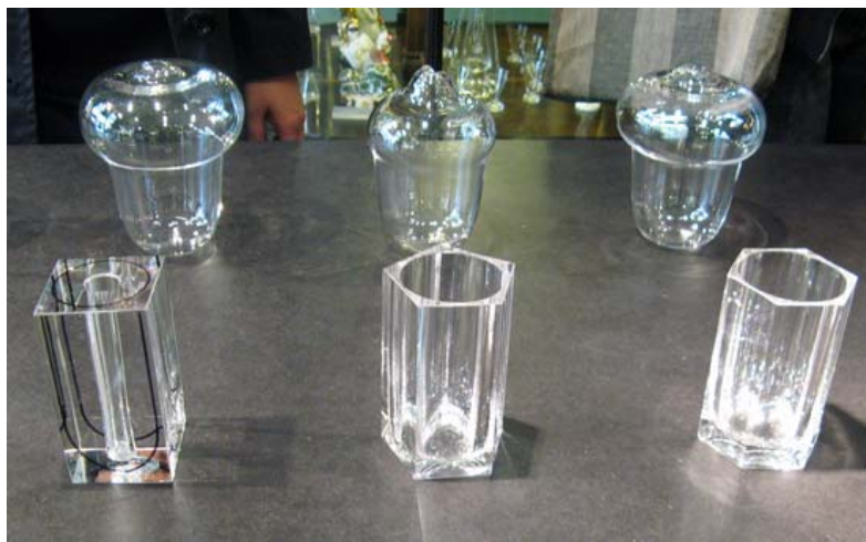
the cutting process continued