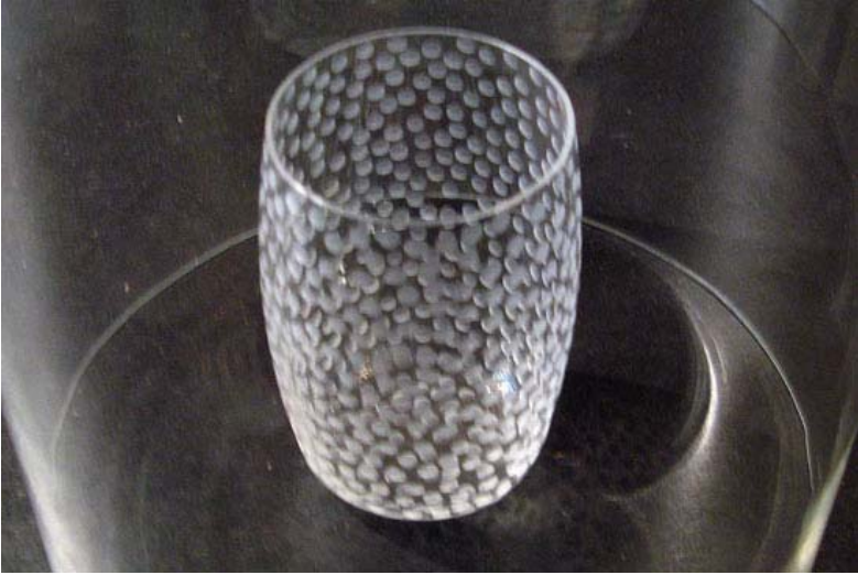
the engraving process...when there is no room left for anymore spheres