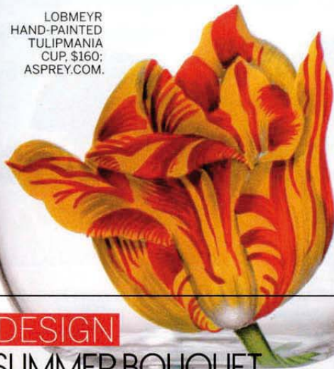
LOBMEYR HAND-PAINTED TULIPMANIA CUP, $160; ASPREY.COM.