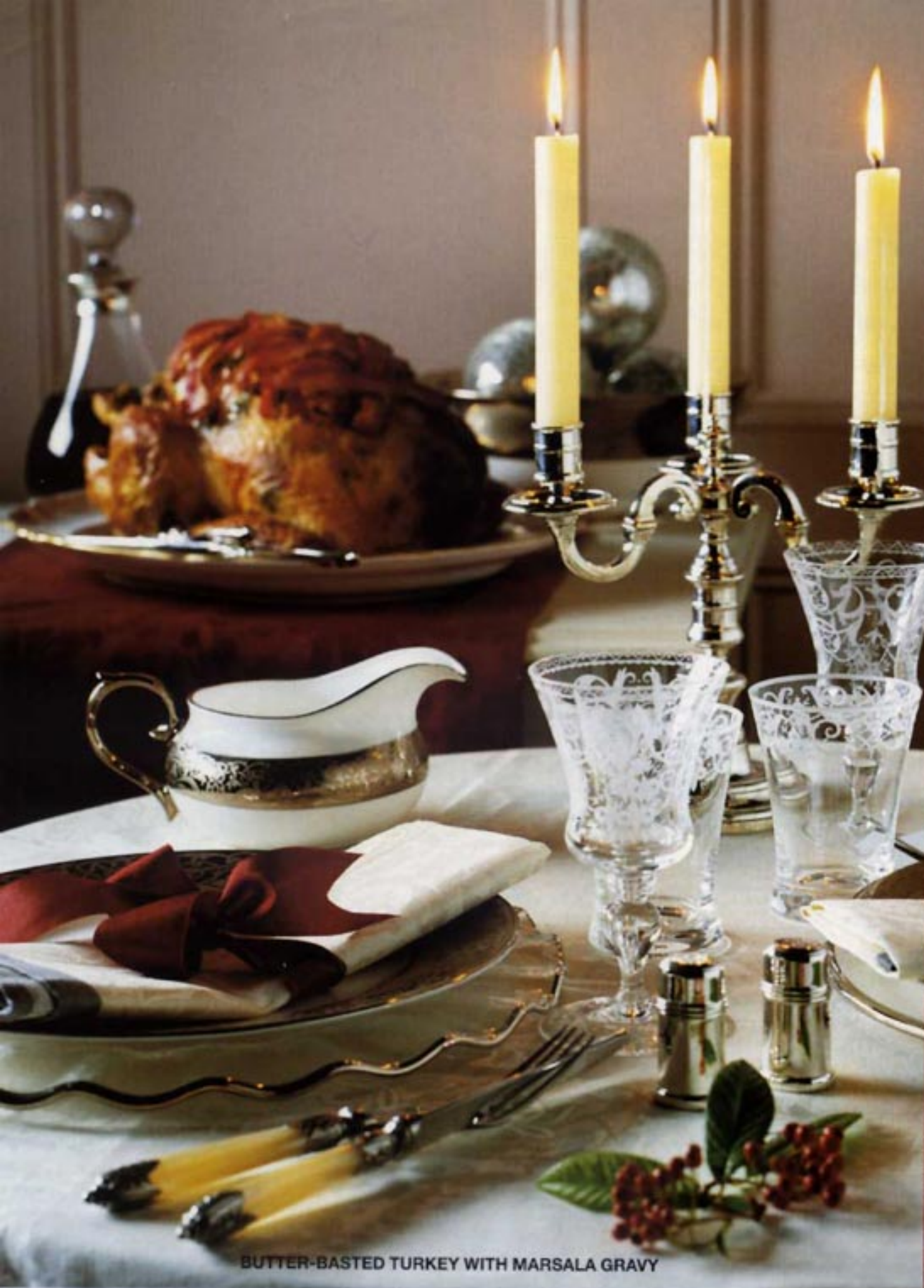
BUTTER-BASTED TURKEY WITH MARSALA GRAVY