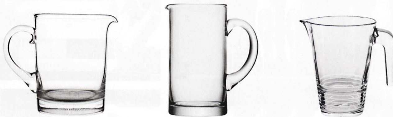
From left 'Loos' crystal pitcher by Adolf Loos for Lobmeyr, £345, Thomas Goode (thomasgoode.com). 'Basis' glass jug, £13, LSA International (lsa-international.co.uk). 'Vänlig' clear glass jug, £1.99, Ikea (ikea.co.uk)