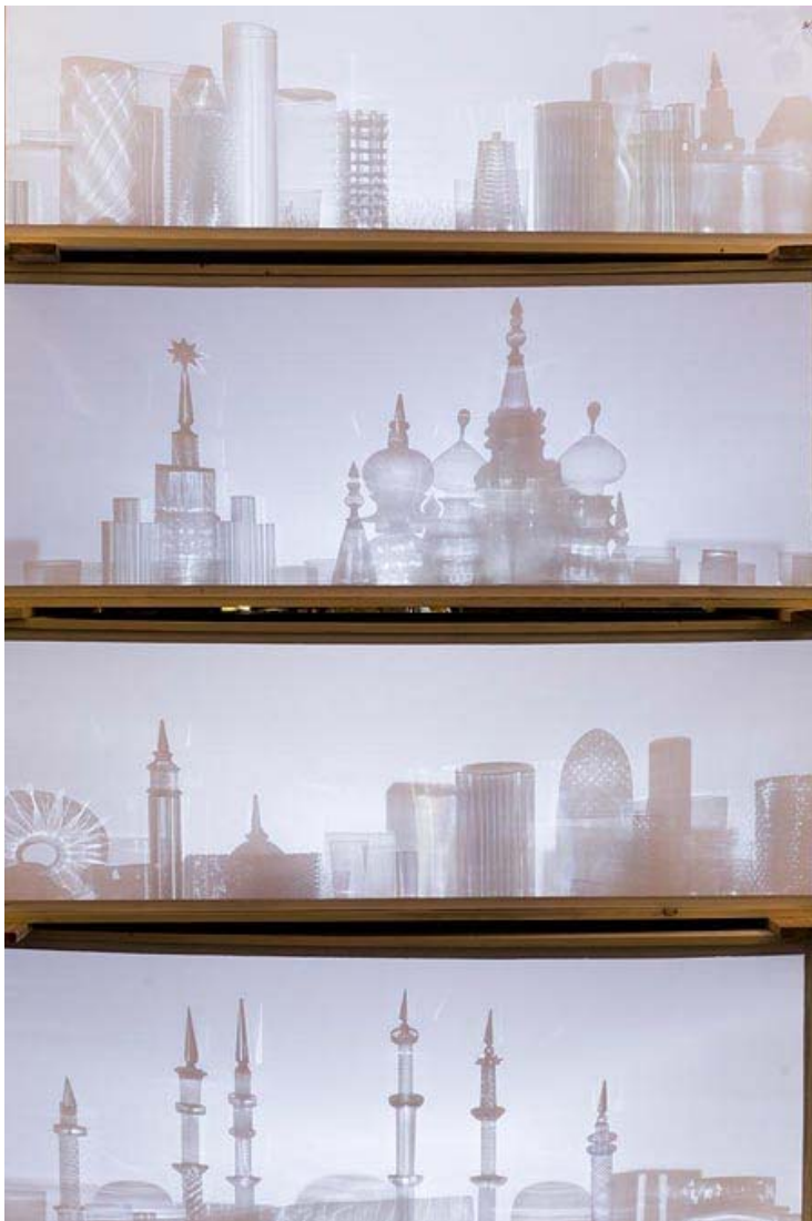
Each arrangement of crystal components, placed inside stacked packing cases, was backlit to project the skyline onto a screen.