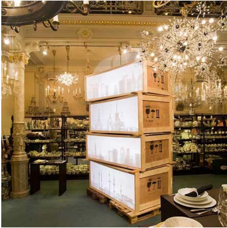
The installation, in Lobmeyr's showroom, featured four "magic lantern" skylines composed of elements from Lobmeyr chandeliers representing Moscow, London, New York and Medina.