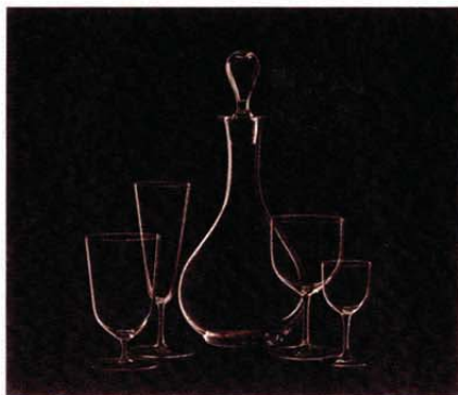
FIG. 1: Drinking set 4, designed, 1856

Lobjmeyr is distributed in the UK by Thomas Goode and Vessel, and by Bergdorf&Goodman, Moss or Neue Gallerie in the US.