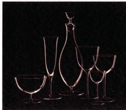
FIG. 2: Drinking set 238 'Patrician', 1917