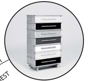
lichterloh.com ● SEVEN DAY CHEST DESIGNER PHILIPP-MARKUS PERNHaupt